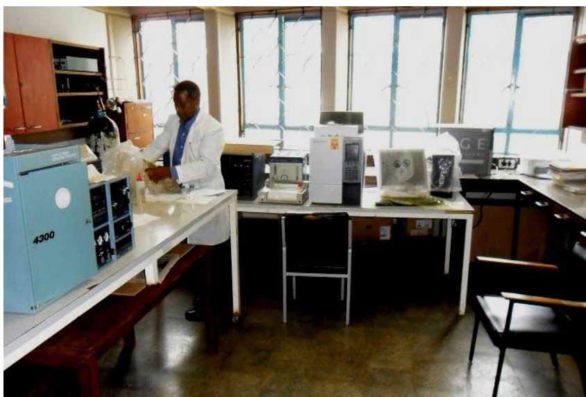
A technologist analyzing pesticide residues using Gas Chromatography

The results obtained showed that all the samples contained arsenic at levels ranging from 0.007 to 0.099 ppm, while the levels of lead ranged from 0.072 to 0.449 ppm. The pesticides detected in the milk samples were heptachlor epoxide, aldrin, 2'4'DDT, 4'4'DDT 4'4'DDD, endrin, deltamethrin and cypermethrin in 7%, 20%, 7%, 13%, 40%, 7%, 73% and 87% of samples respectively. None of the samples analysed contained quantifiable levels of veterinary drug residues at the detection limit of 1ppm. The samples were also not found to contain detectable levels of aflatoxin M 1 at detection limit of 5 ppt. The results of the study indicated that sample had levels above the recommended maximum residue limits (MRL) and acceptable daily intakes (ADIs).