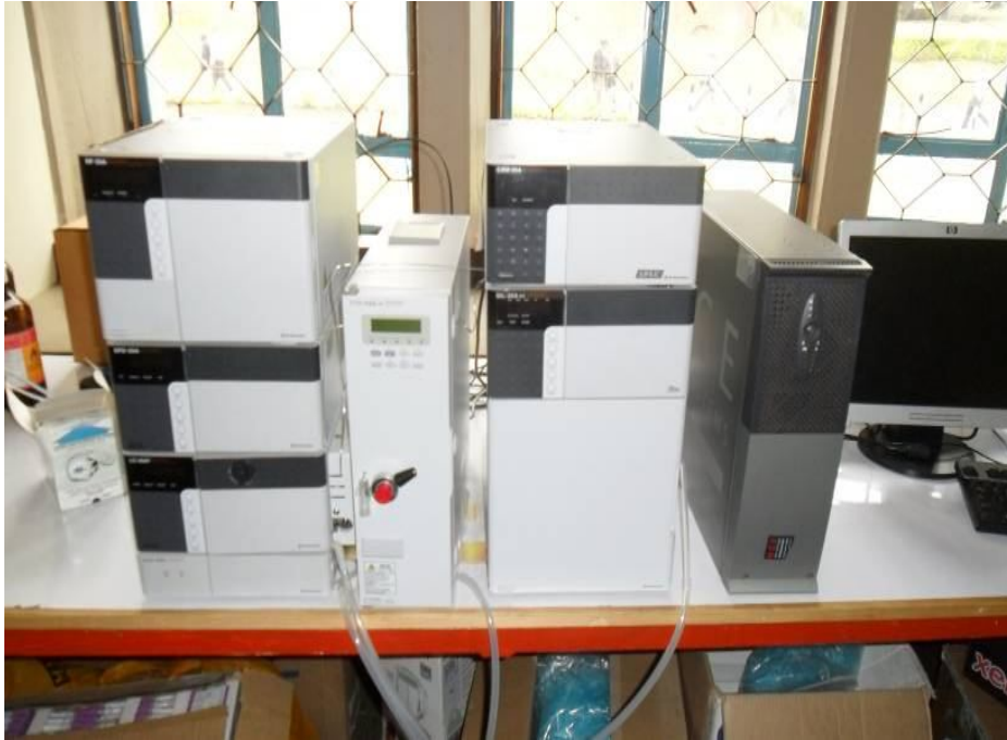
HPLC for analysis of drug residues and mycotoxins in the Department of Public Health, Pharmacology